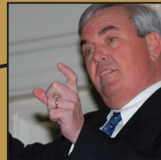
Postmaster General Jack Potter